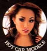
HOT CAR MODELS