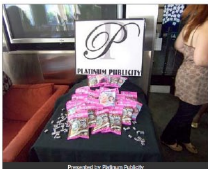
Presented by Platinum Publicity

With gift suites all over Hollywood, Melanie Segal's 2008 Emmy Award Gift House was the place to be to get some awesome celebrity gifting! Presented by Platinum Publicity, located in West Hollywood in a private multistory house, the suite took place with many celebrity visitors in sight. With a view looking over the Sunset Strip the suite had a cool, relaxed, exciting atmosphere where Segal's guests could enjoy beverages, snacks, and desserts while they enjoy shopping for their amazing gifts they were welcomed too.